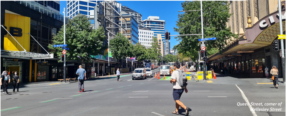
Queen Street, corner of Wellesley Street

Improving the wastewater network in Midtown